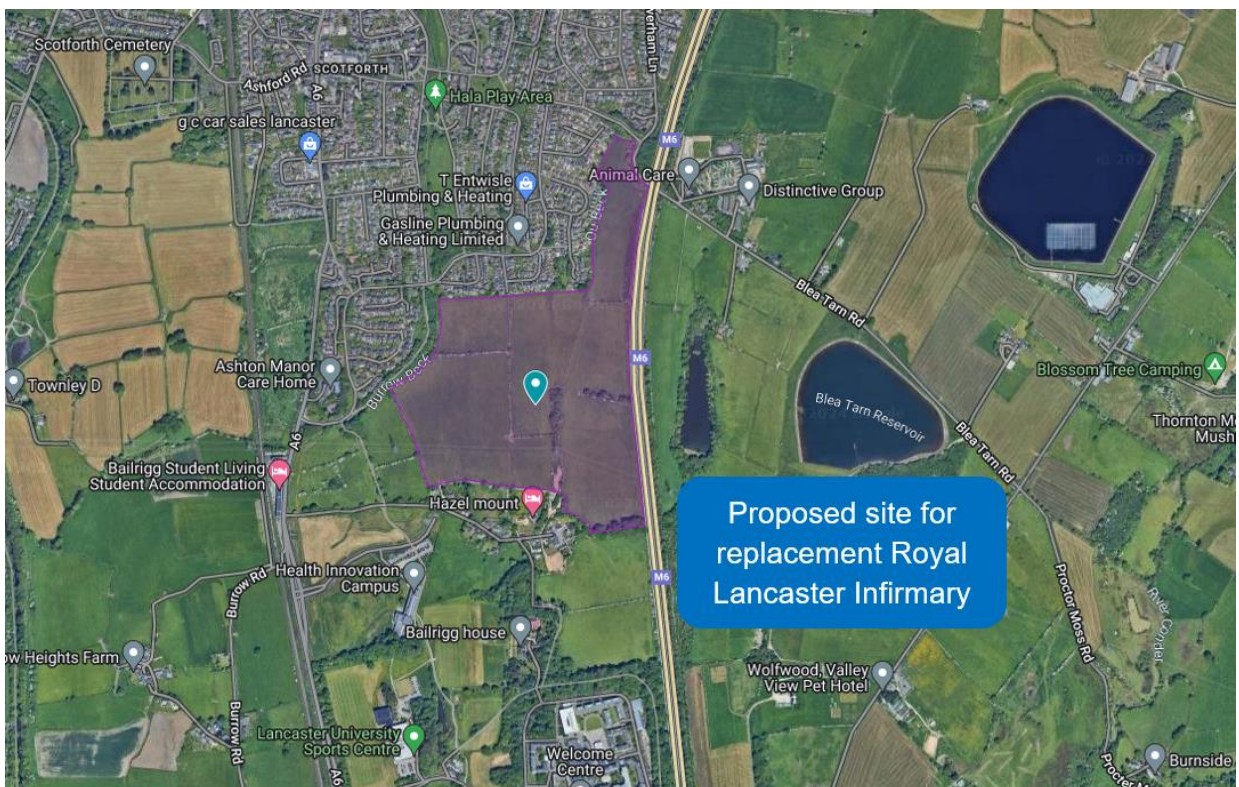
Above: Map showing proposed site for replacement Royal Lancaster Infirmary. (Image credit: Google, 2024).