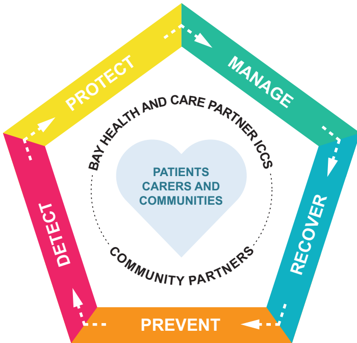
Figure 1. Diagram of the Pentagon Approach to managing Population Health developed by Morecambe Bay CCG.

As detailed in Figure 1 below, the Pentagon Approach is made up of five actions; Prevent, Detect, Protect, Manage and Recover. These actions do not come in a defined order, rather, they should be thought of as happening simultaneously and should be on-going.