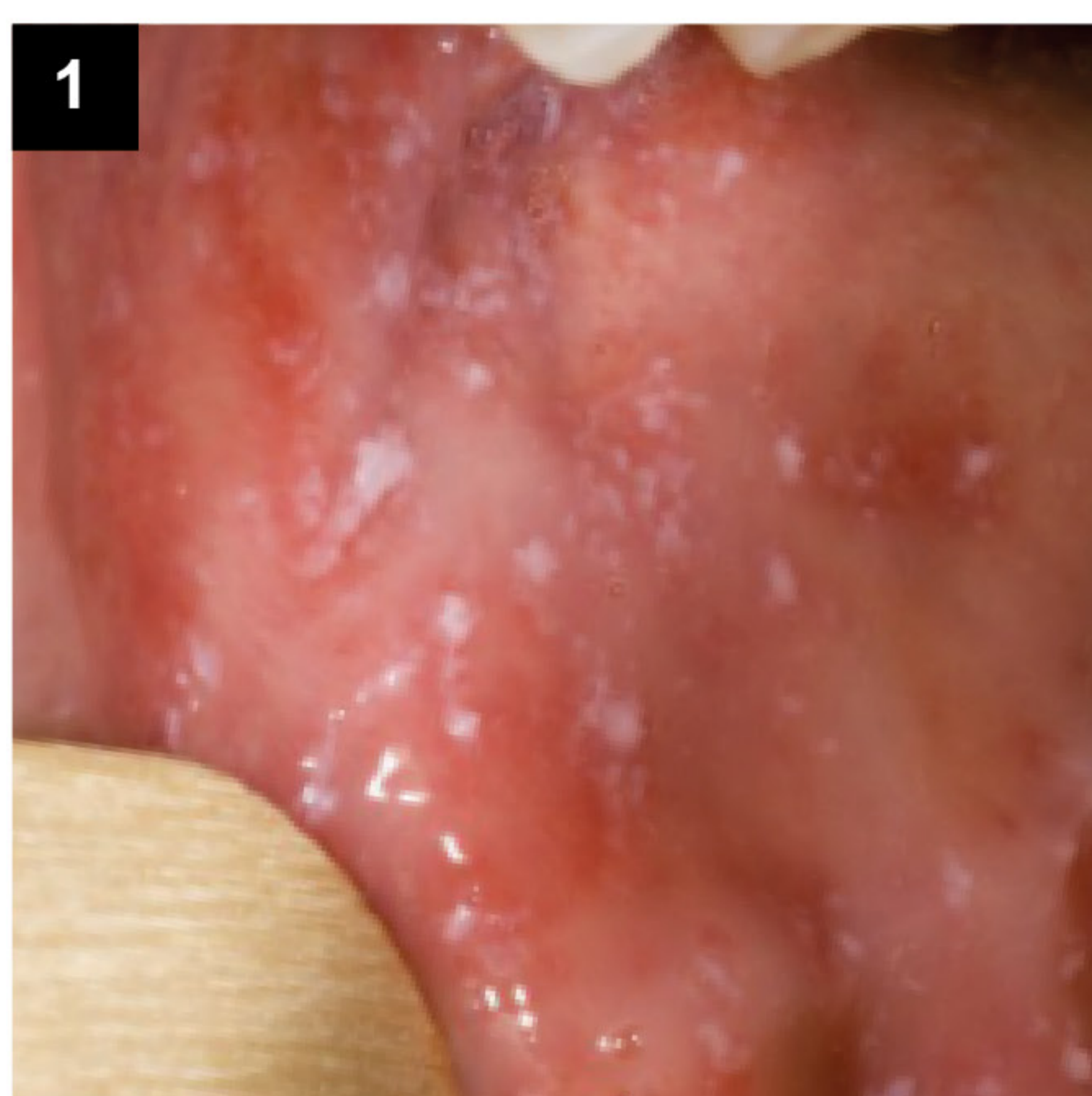
1. Measles spots in the mouth