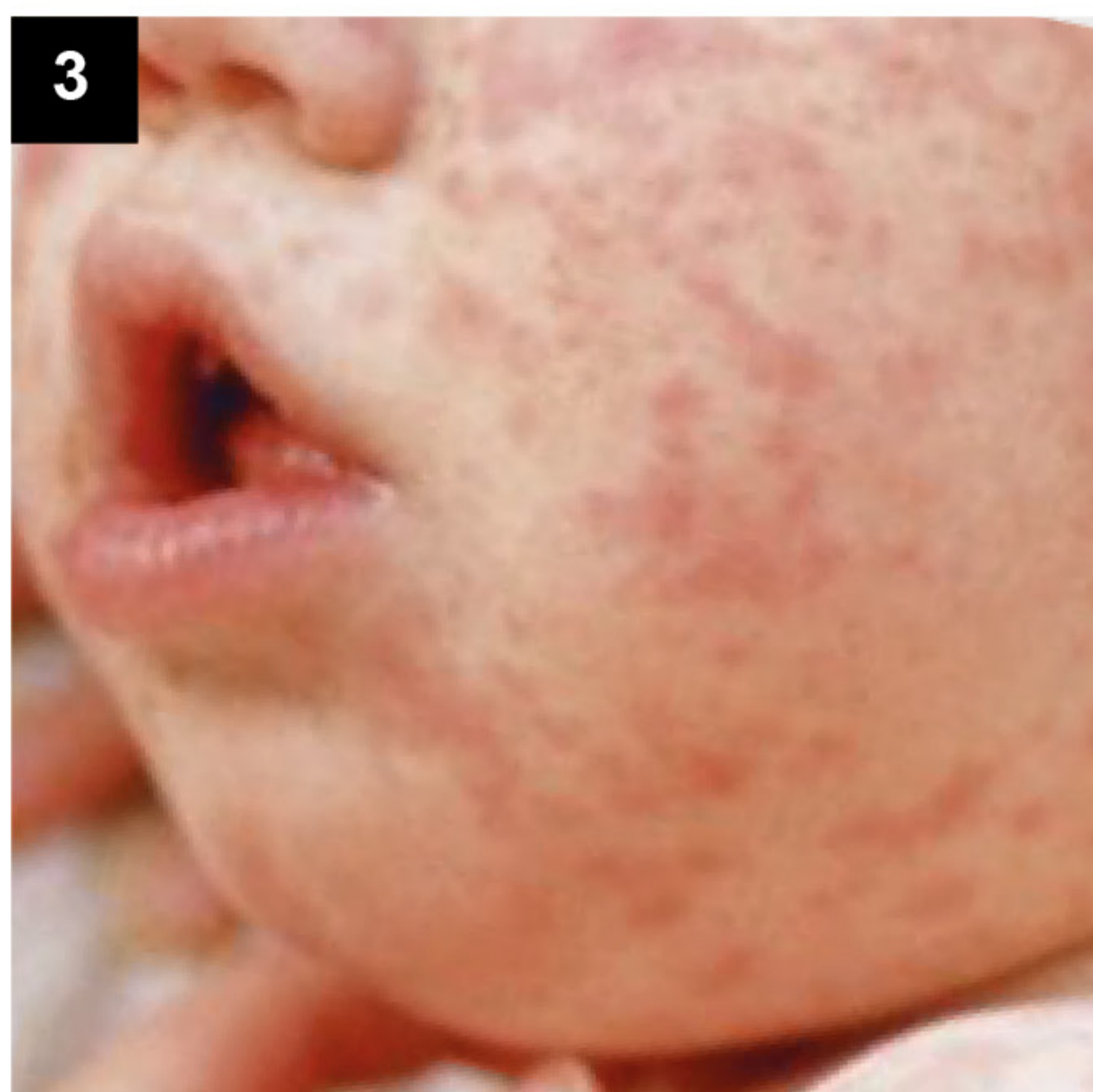
3. Measles spots on the face