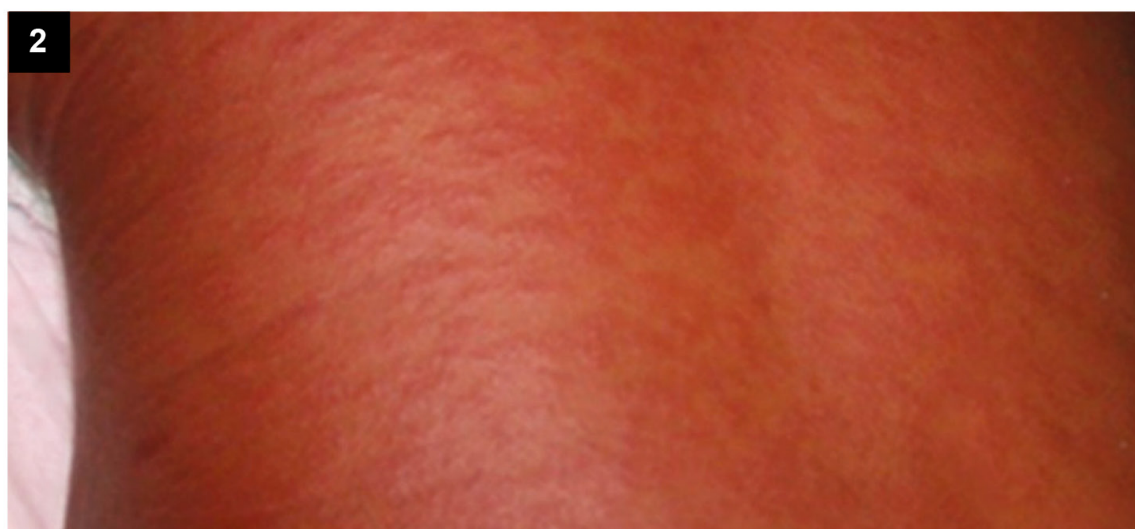
2. Measles spots on darker skin