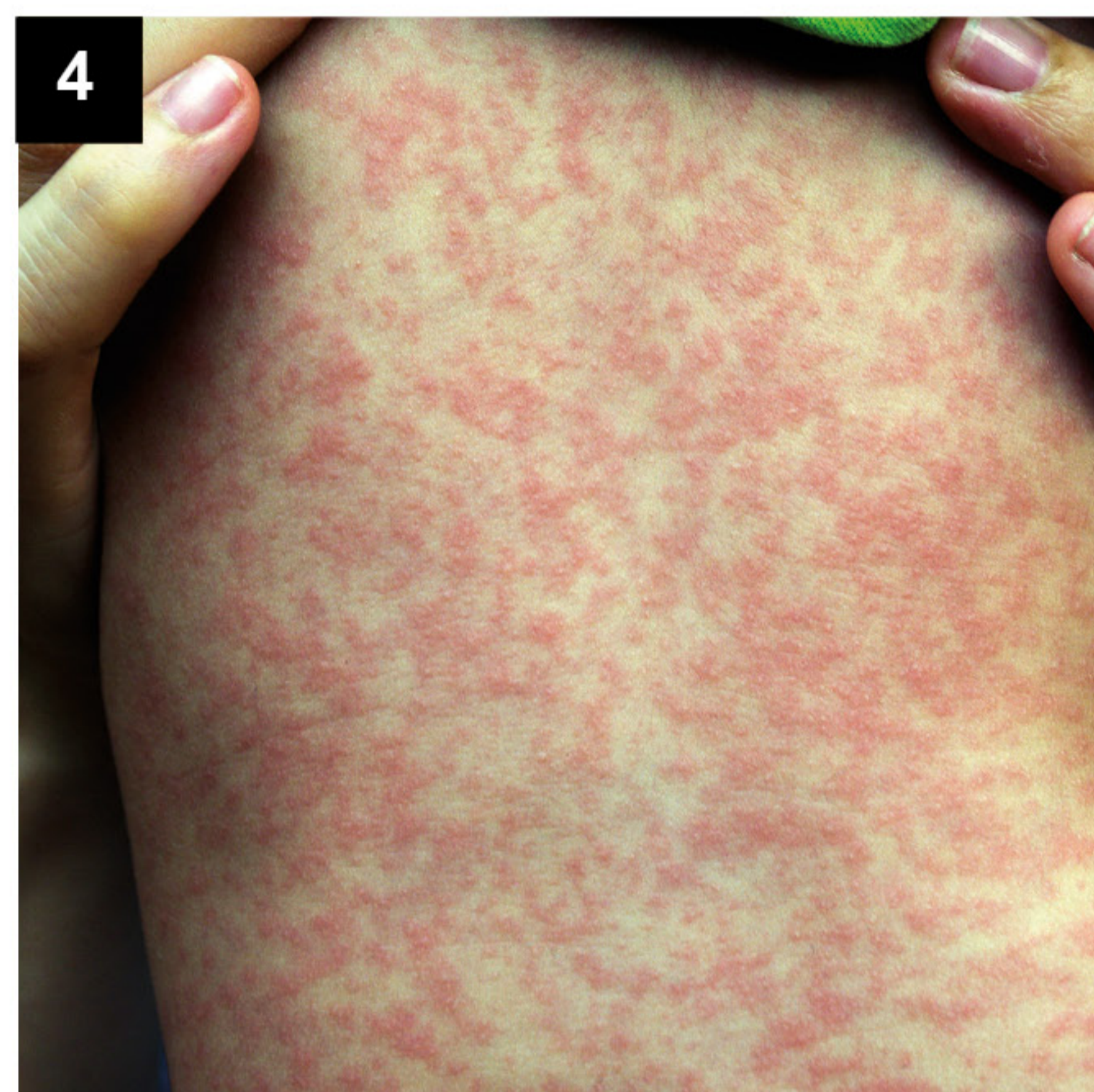
4. Measles spots - raised rash