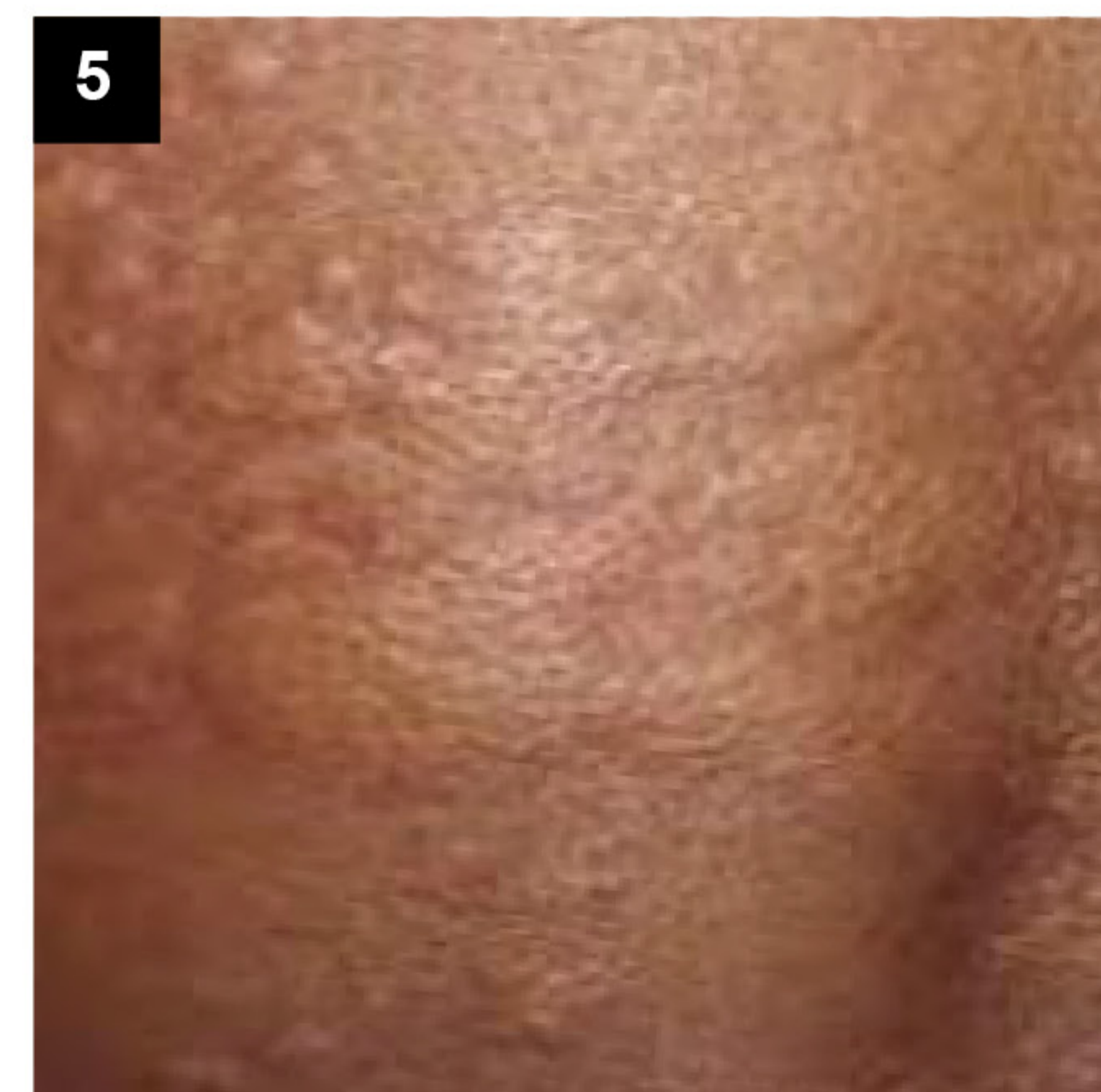
5. Measles spots joined together