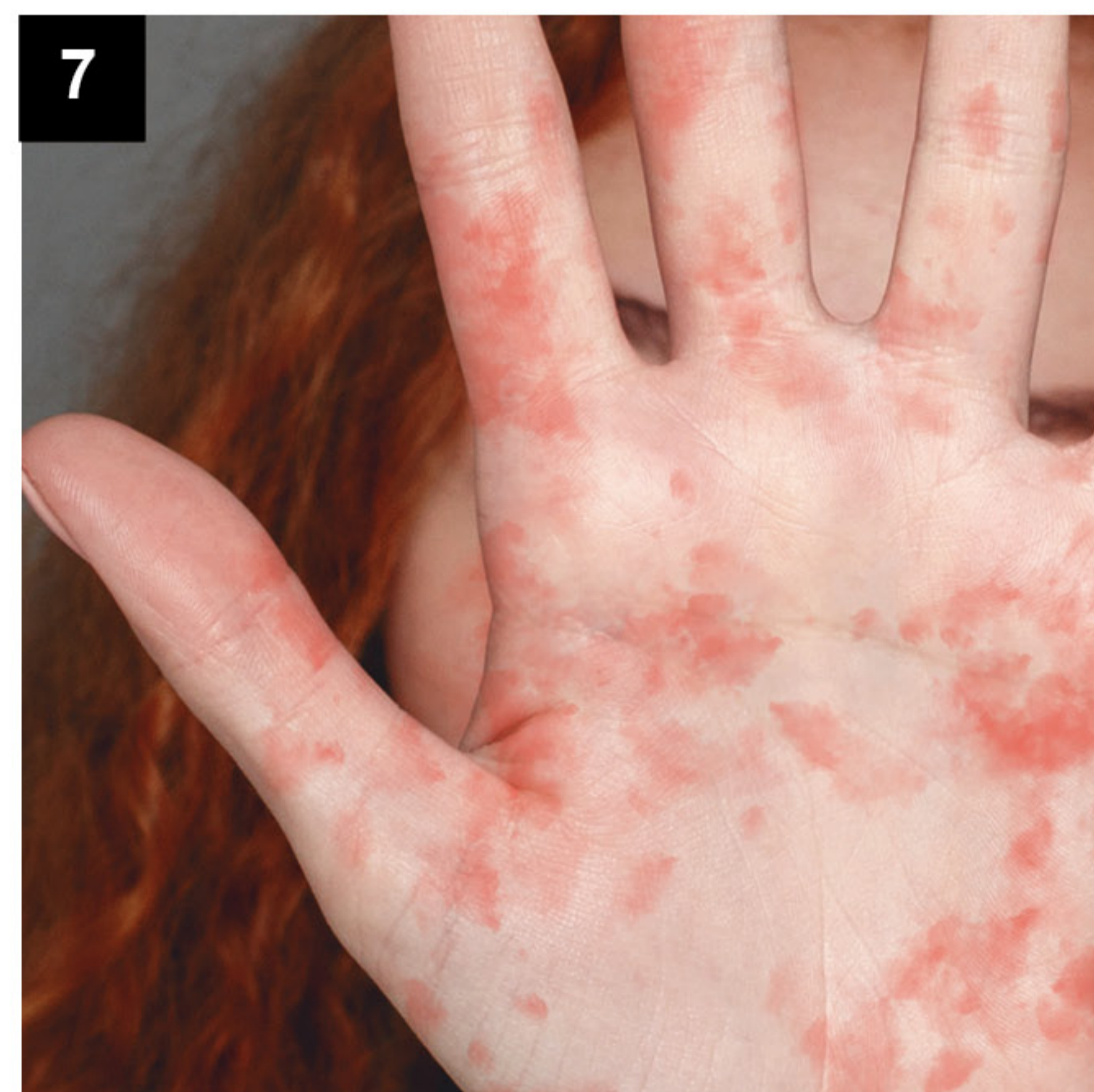
7. Measles spots on the palm of the hand